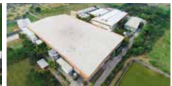
Shakti Hörmann Pvt. Ltd., India

Hörmann is the only manufacturer worldwide that offers you a complete range of all major building products from one source. We manufacture in highly-specialised factories using the latest production technologies. The close-meshed network of sales and service companies throughout Europe, and activities in the USA and Asia, make Hörmann your strong partner for first-class building products, offering “Quality without Compromise”.