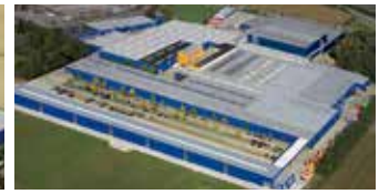
Hörmann KG Brockhagen, Germany