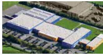
Hörmann KG Antriebstechnik, Germany