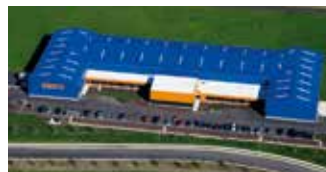
Hörmann Flexon LLC, Burgettstown PA, USA