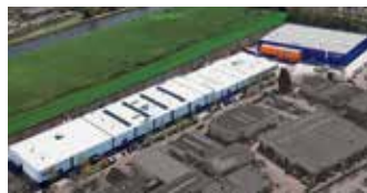
Hörmann Alkmaar B.V., Netherlands