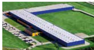
Hörmann Legnica Sp. z o.o., Poland