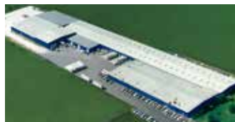
Hörmann LLC, Montgomery IL, USA