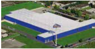
Hörmann KG Dissen, Germany