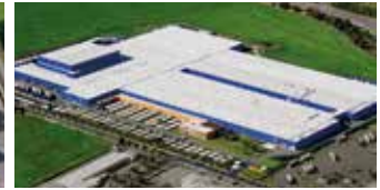
Hörmann KG Ichttershausen, Germany