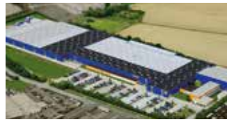
Hörmann KG Brandis, Germany