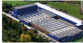
Hörmann KG Freisen, Germany