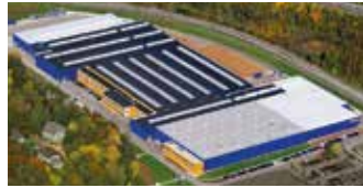
Hörmann KG Eckelhausen, Germany