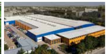
Hörmann Beijing, China