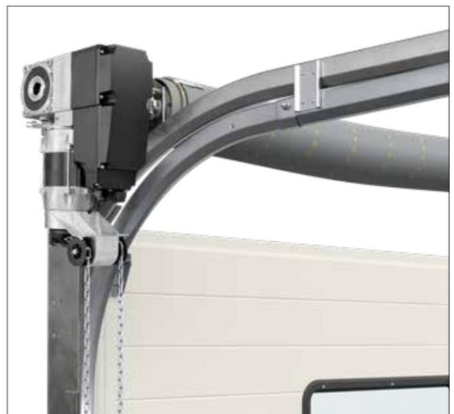
High Speed Door Operator WA500FU 1 Meter Per Second