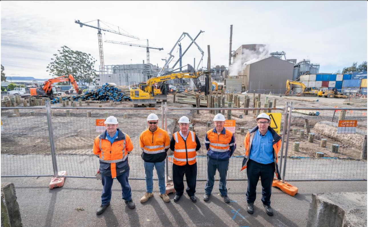
Manildra Group Breaking ground on Cogeneration Transition December 2022